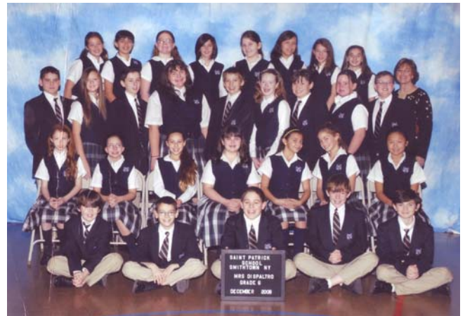
St. Patrick School Class 6-1 sent school supplies to fellow students in Africa as their class project.